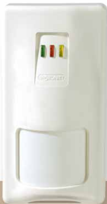
iWISE DT PET